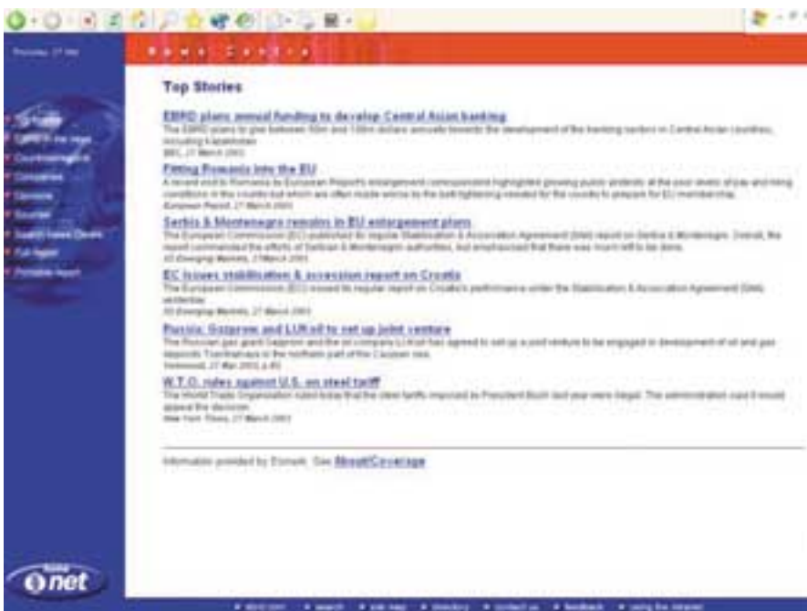
Esmerk Pro@ctiv "Top Stories" screenshot as seen on the EBRD Intranet.

Esmerk supplies leading international companies with intelligently tailored essential information of their business environments. We now have tens of thousands end users throughout the world, being serviced by a network of offices around the world.