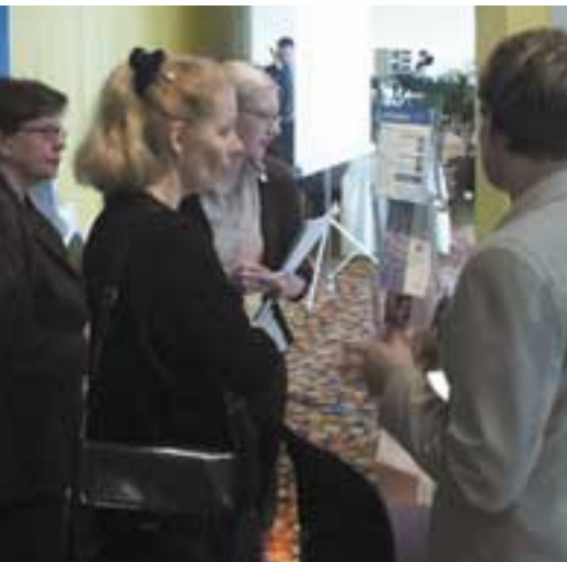
The information event attracted many guests.

Professionals and customers of the information services sector met at the Tietopäivät information event arranged by the Finnish Society for Information Services. The event replaced the Business Information fair of previous years and presented a comprehensive picture of present trends, and of what the sector has to offer.