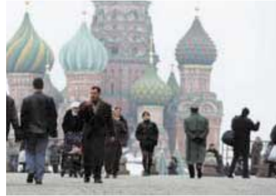
Cathedral of St. Basil, Moscow.

The European Bank for Reconstruction and Development (EBRD) was established in 1991 when communism was crumbling, and Eastern Europe and ex-Soviet countries needed support to nurture a new private sector in a democratic environment. Today the London-based EBRD uses the tools of investment capital to help build market economies and democracies in 27 countries from central Europe to central Asia.